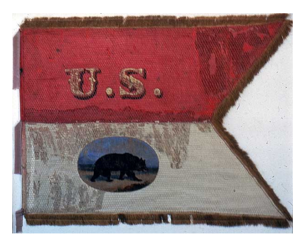
Silk Guideon of the California Hundred

their return to Assembly Hall, the unit was paraded through the principal streets of San Francisco.<sup>22</sup>